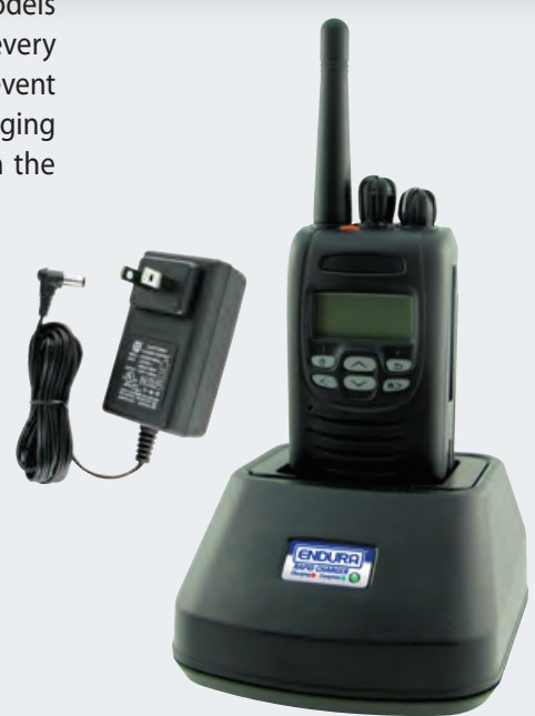
Model TWC1: The TWC1 single unit charger is ideal for desktop use. It includes an AC to DC power supply (UL listed), charging pod, user manual, and 12-month warranty.