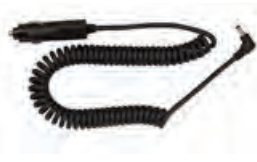
Part Number: TWC6M-VPA (Also for use with TWC1M.)