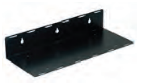
Part Number: TWC6M-MB