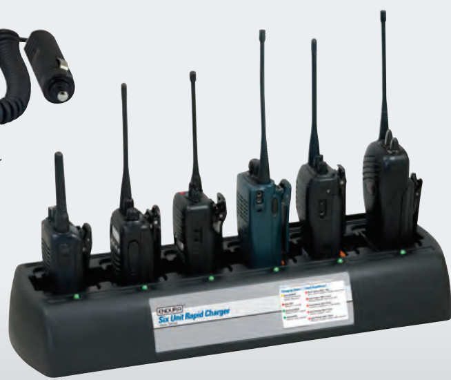
Model TWC6M: The TWC6M is a multi-unit charger with a compact footprint and ideally suited for use in an office, shop, or mobile command center. The TWC6M includes an AC to DC power supply (UL listed), six charging pods, user manual, and 12-month warranty.