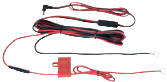
Part Number: TWC6M-HW (Also for use with TWC1M.)

A sturdy metal mounting bracket, hard wire kit, and vehicle power adapter are optional accessories for the TWC6M. The mounting bracket allows the charger to be wall mounted in an office or vehicle and includes tie-down straps, fasteners, and installation instructions. With the heavy duty vehicle power adapter, the TWC6M may be powered from a vehicle's 12V or 24V outlet.