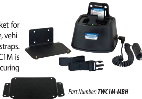
Part Number: TWC1M-MBH

The TWC1M includes a mounting bracket for securing the charger to a vertical surface, vehicle power adapter, and two tie-down straps. An optional accessory available for TWC1M is TWC1M-MBH, a mounting bracket for securing the charger to a horizontal surface.