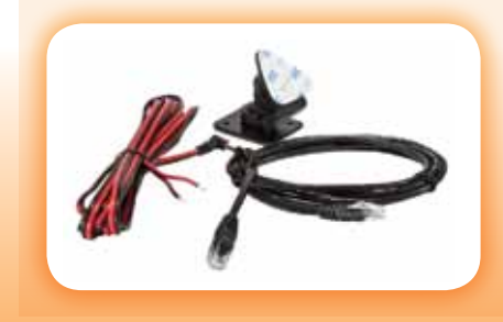
Installation accessories include DC power cable, controller to radio holder interface cable, and multidirectional mount with fasteners.

The Logic Energy radio holder features the industry's most compact footprint and lowest profile. It allows a radio to be installed in locations where space is limited and where access to the radio is more convenient. The restraining cord holds the radio securely in place, includes a quick-release latch, and is adjustable.